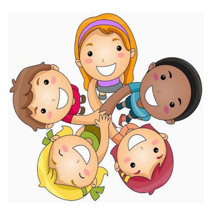
I miss seeing my friends at Nursery but I know they are safe at home.