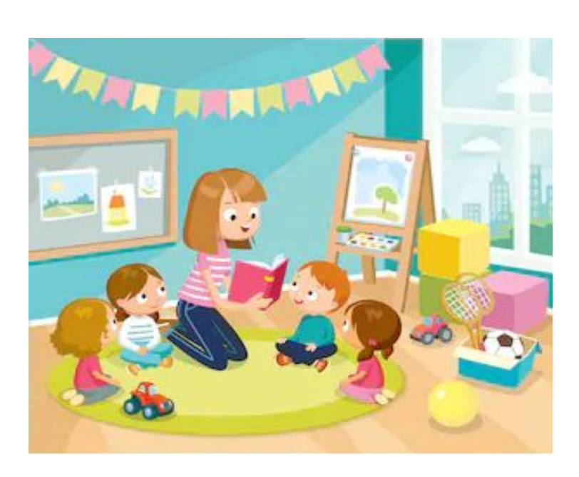
I miss seeing my key worker too. I know I will see them when Nursery is open again.