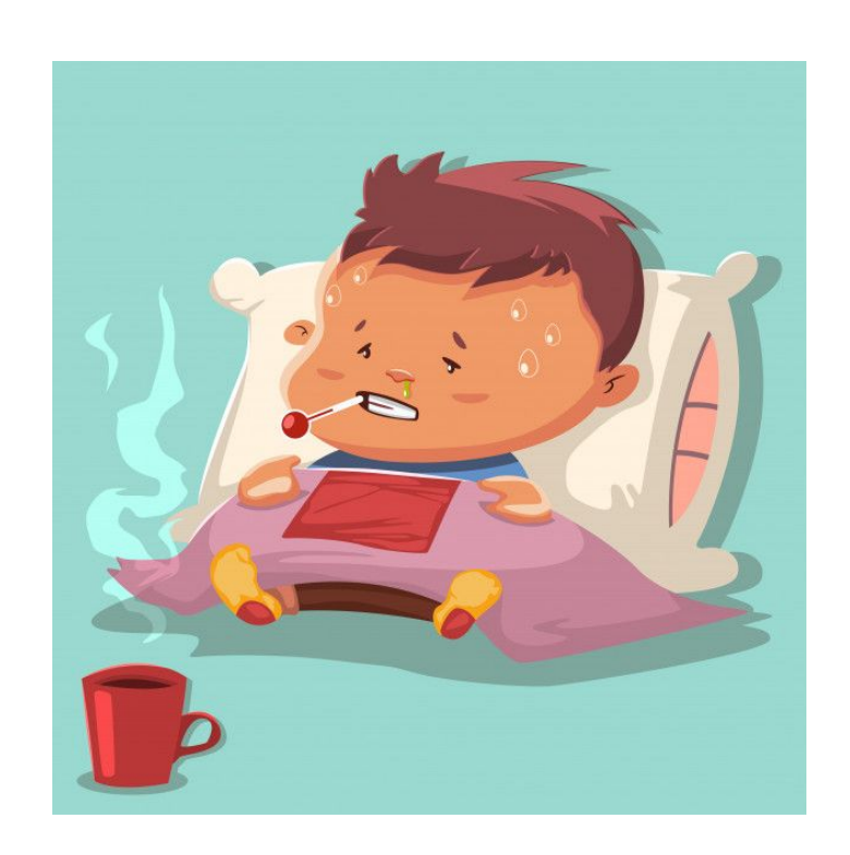
Germs called Coronavirus are making some people ill just now.