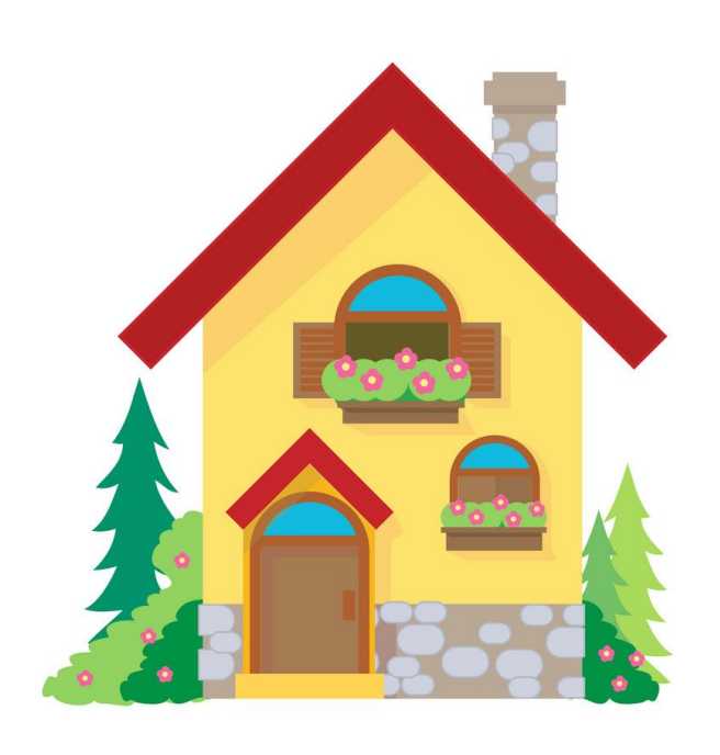
So, it is important I stay in my house and garden to help stop the germs from spreading.