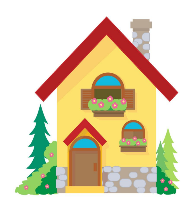
When people get ill, they need to stay home. This means the germs don't spread.